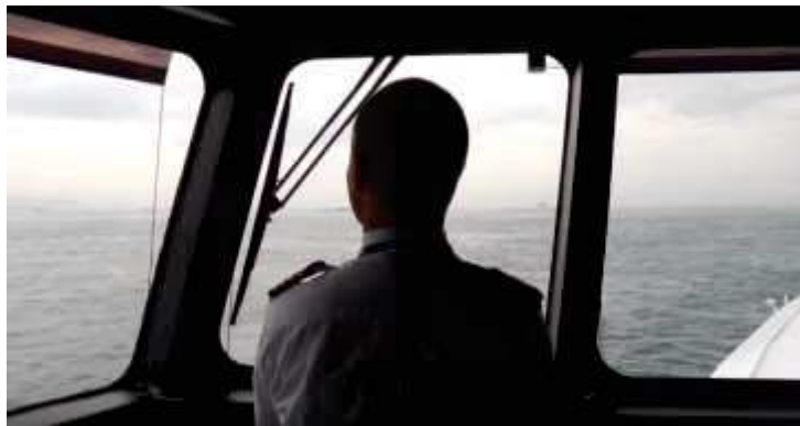
LOOKING OUT OF THE BRIDGE WINDOW

The fabled mark on one eyeball is very good at picking up changes, particularly when there things to see. Such a change in heading would be very apparent from looking at the seascape, especially in the instance that there are navigation aids marking a channel with leads and any departure from the original track can immediately be picked up visually.