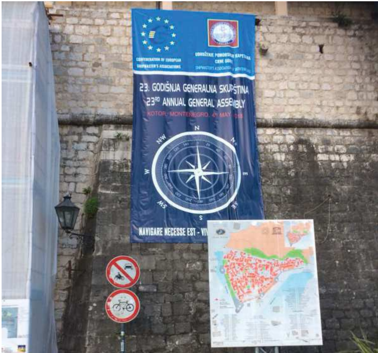
THE FAMOUS GATE TO ENTER THE CITY OF KOTOR

Entering the city of Kotor, the delegates attending the CESMA Annual General Assembly, were welcomed by a banner announcing the CESMA meeting. The city was well defended in ancient times by huge city walls to fight of attackers of many categories, including pirates. The gate, which could be well defended, was the only entrance to the city which has played an important role in seafaring and ship owning during the years. The families of many shipmasters, also owning their own vessels lived in Kotor during the ages. Today many seafarers, educated and trained at the prestigious maritime institute of Kotor, man ships all over the world. They include shipmasters on cruise vessels and container vessels.