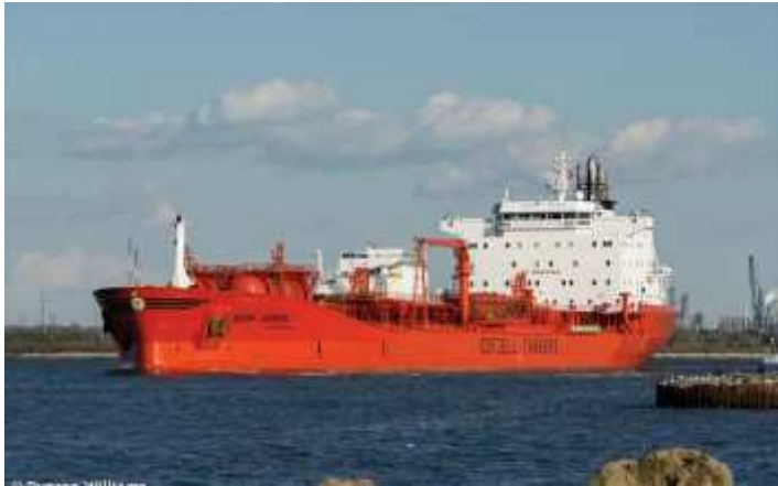
MT "BOW JUBAIL"

On 23 rd June, this year, the Norwegian owned produce tanker "Bow Jubail", while coming alongside her berth in the Third petroleum Haven in Rotterdam, hit with the aft ship an unprotected sharp part of the jetty, causing a gash in a fuel oil tank. As a consequence, 217 tons of fuel oil leaked into the harbour, a side branch of the River Maas.