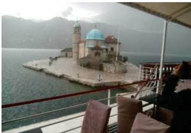
ISLET OF OUR LADY OF THE ROCK