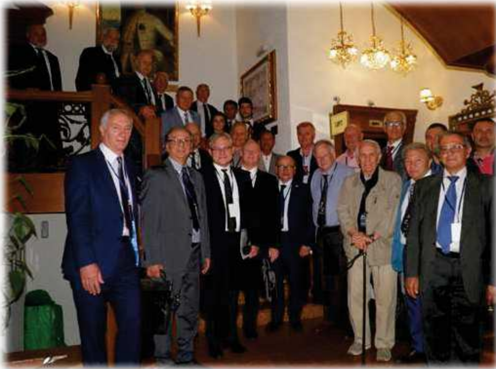
CESMA COUNCIL AT HOTEL CATTARO