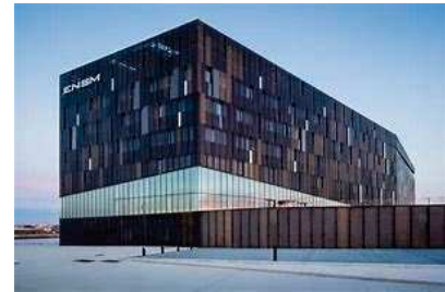
ENSM IN LE HAVRE (FRANCE)

Young people in maritime schools, still actually a majority of them, want to go to sea. Today, but for how long? It depends only on the attitude of the person who stay waiting ashore. It should be said. Also that there are a lot of possibilities to work in the maritime environment, not on vessels, but domains where the experience at sea will be a great advantage. Education in a maritime school, particularly, work as an officer, gives quite early such experience on management, human and technical aspects. When you read interviews of ex seamen now working ashore, they all say that their experience on vessels helped them when they started to find a new job ashore, and still help them now at work.