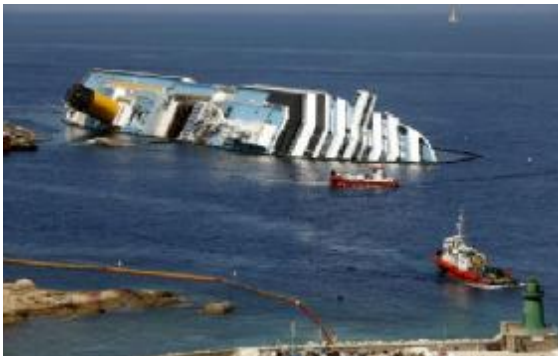
Lessons to be learned

According to Lloyd's List, Italy has yet to confirm the inclusion of amendments to European passengershhip safety rules into its national laws although it was notified to do so in November 2011. The Commission is still waiting to hear whether a Directive that was written and agreed in 2010 on safety rules and standards for passengershhips has been included in Italian law, as it has in nearly every other European Union Member State. These rules are almost identical to the latest safety amendments of the International Maritime Organisation's SOLAS Convention but they were specifically written to close a loophole with large domestic ferries. IMO rules do not apply to registered domestic traffics. As the "Costa Concordia" was on an international voyage, the Commission maintains that the directive was written to ensure that all passengershhips, trading in European waters, were operating to the same standards.